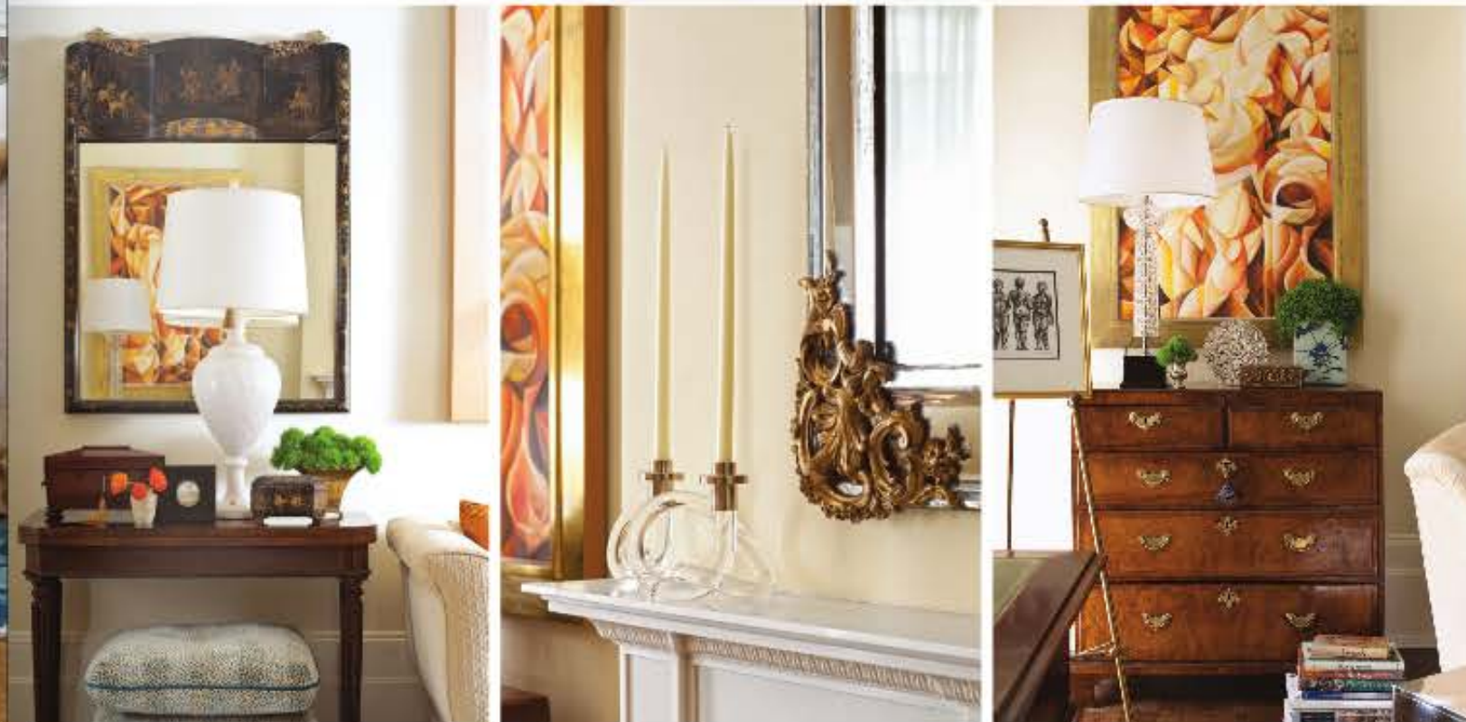
opposite: This timeless living room embraces color with Schumacher orange silk-taffeta drapes and a turn-of-the-century Chinese carpet in blue; below: A three-cushion pouf covered in Cowtan & Tout turquoise Malabar nestles below a Regency rosewood game table. Above the mantel: a 19th-century Italian mirror. One of Hill-Edgar's paintings hangs over an 18th-century George II walnut chest.